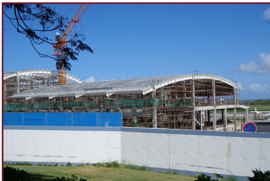
A view of the new terminal at V.C. Bird International Airport in Antigua, being built with assistance from the China Civil Engineering Construction Corporation.

“Undoubtedly, some subjects are more delicate than others,” Bethel McKenzie said. “But we believe that the role of the media in any country is to inform citizens about matters that affect their lives. No matter how uncomfortable or inconvenient certain information may seem, the Antiguan people have a right to know about it.”